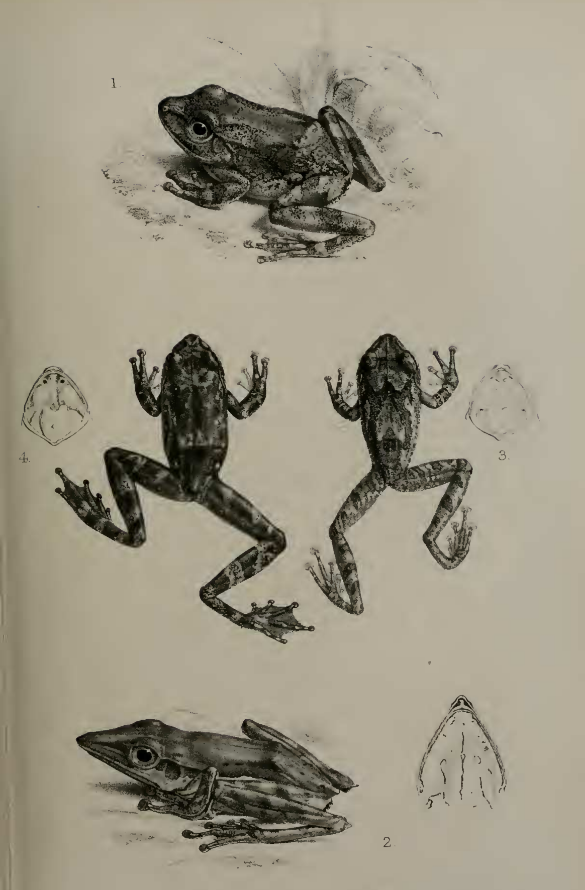
1.Polypedates cavirostris. 2.Polypedates nasutus. 3.Polypedates nanus. 4.Ixalus macropus.